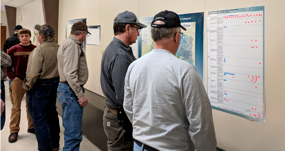
During a public informational meeting about the Thief River One Watershed, One Plan, maps and tables depicted resource concerns identified by a public vote. Houston Engineering and planning partners used input gathered at public meetings to identify 1W1P priorities.

Combined with surface water reports, they give planners a more complete picture of restoration and protection strategies as they complete One Watershed, One Plan